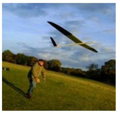
Model aircraft slope soaring

However, model flying conducted outside of clubs/associations does remain within the scope of EASA regulations and will fall within the 'Open Category' which imposes requirements for registration and proof of competency on the operator, as well as a default age limit of 18 years. We have told DG MOVE that this age restriction is likely to present a barrier to participation, is disproportionate and not based on any genuine analysis of the risk.